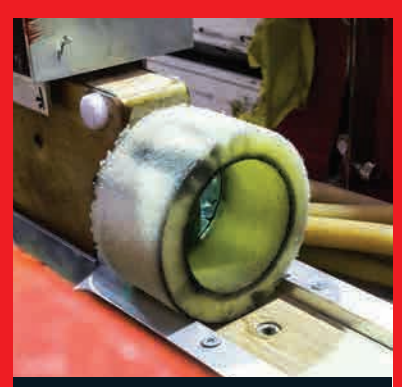
The launcher released 'hailstones' at speeds of up to 172 kph