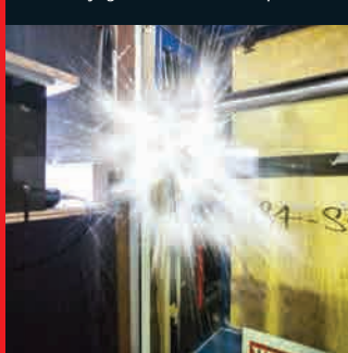
At the end of the test there was no damage at all on any of the three VELUX skylights