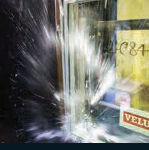
The skylights were hit at their weakest points - the corners