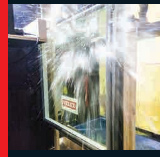
Each skylight was hit four times with 50 mm hailstones at 135 kph and four times with 72 mm hailstones at 150 kph+